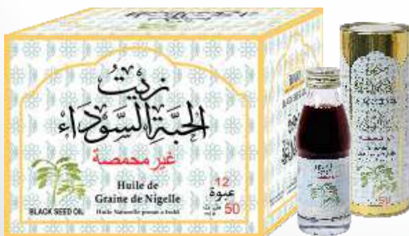
50ml x 12 pcs compo can