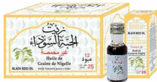
25ml x 12 pcs box