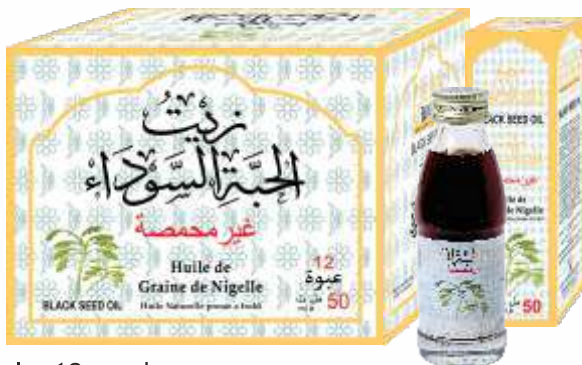
50ml x 12 pcs box