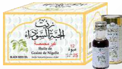
25ml x 12 pcs compo can